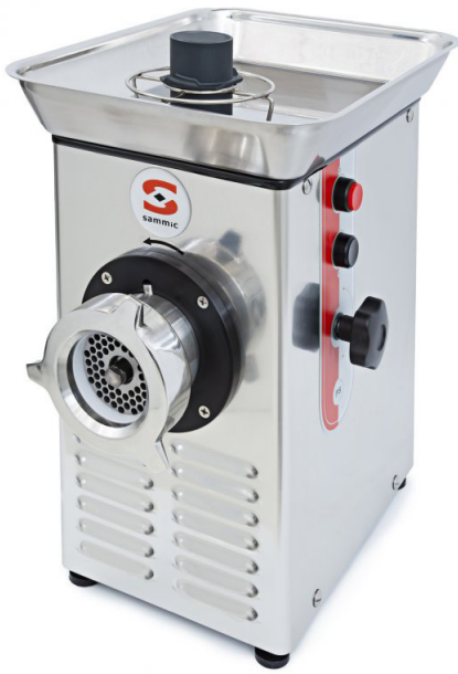
Plate diameter: Ø 82 mm Inlet mouth diameter (1) : 60 mm Plug: -- Electrical connection: -- Total loading: 740-1100 W Refrigerated mincer: No External dimensions (WxDxH) ✓ Width: 310 mm ✓ Depth: 440 mm ✓ Height: 480 mm Net weight: 31 Kg Noise level (1m.): <70 dB(A) Background noise: 32 dB(A) IP Protection grade: 21